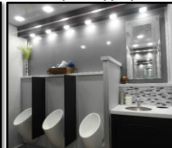
Decorative Tile Upgrade